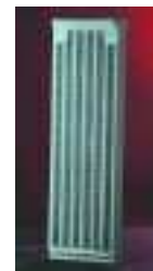
Electric resistance radiant panel. ▲